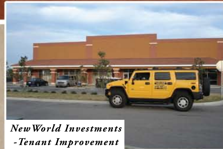
New World Investments -Tenant Improvement

WE THRIVE ON CHALLENGING PROJECTS. WE WILL BUILD TO YOUR PLANS AND SPECIFICATIONS, OFFERING OUR EXPERTISE AND EXPERIENCE ALONG THE WAY. OR, WE CAN GUIDE YOU THROUGH A TOTALLY CUSTOM DESIGN/BUILD PROCESS UNIQUE TO YOU. WE ARE METICULOUS ABOUT PAYING ATTENTION TO EVERY DETAIL TO GUARANTEE THE QUALITY AND VALUE OF EVERY WELL – BUILT HOME AND PROJECT IN ORDER TO ENHANCE OUR CLIENTS' LIFESTYLE OR BUSINESS.