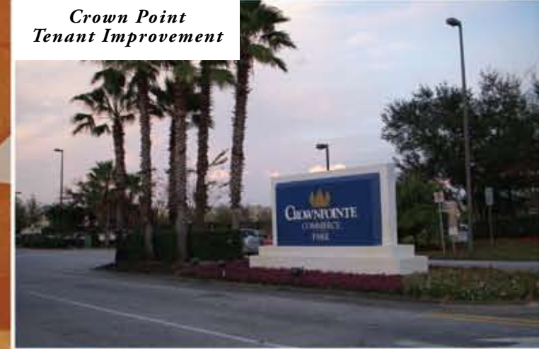
Crown Point Tenant Improvement