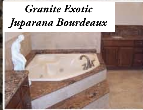
Granite Exotic Juparana Bourdeaux

BALDWIN GRANITE, A FOCUS BUILDERS, INC. DIVISION, HAS PROVIDED RESIDENTIAL AND COMMERCIAL INDUSTRIES WITH CUSTOM GRANITE COUNTERTOPS FOR OVER SEVEN YEARS. THE VERSATILITY OF OUR COUNTERTOPS MAKES THEM IDEAL FOR KITCHENS, BARS, VANITIES AND MORE. WE WORK ONE ON ONE WITH BUILDERS AND HOMEOWNERS, EXPERTLY TURNING THEIR VISIONS INTO REALITIES. WE ARE TRULY PASSIONATE ABOUT WHAT WE DO AND KNOW THAT THIS BUSINESS IS MORE THAN JUST GRANITE SLABS; IT'S ABOUT BUILDING RELATIONSHIPS WITHIN AN INDUSTRY THAT DEPENDS HIGHLY ON INTEGRITY AND GOOD FAITH. BUILT ON AN ESTABLISHED REPUTATION FOR PROFESSIONAL EXCELLENCE, OUR TRUE SUCCESS IS MEASURED BY OUR CUSTOMERS' SATISFACTION. FOR UNMATCHED SERVICE AND EXCEPTIONAL GRANITE PRODUCTS, CALL BALDWIN GRANITE AT (407) 745-0964.