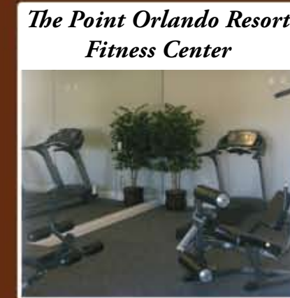
The Point Orlando Resort Fitness Center