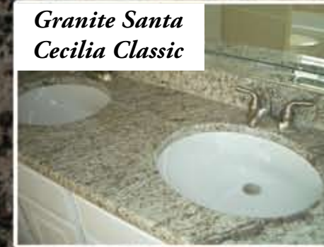
Granite Santa Cecilia Classic