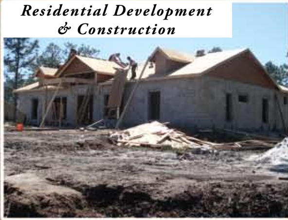
Residential Development & Construction

WE PRIDE OURSELVES IN OUR CAPABILITY TO THOROUGHLY EXCEED OUR CLIENTS' EXPECTATIONS, AND OUR JOB IS NOT FINISHED UNTIL EACH ONE IS MORE THAN SATISFIED. WE EXPECT NOTHING LESS OF OURSELVES! WE ARE CURRENTLY DEVELOPING COMMERCIAL AND RESIDENTIAL PROPERTIES IN CENTRAL FLORIDA. YOUR HOME AND PROJECT IS ONE OF THE GREATEST INVESTMENTS YOU WILL EVER MAKE, AND WE ARE THERE TO SUPPORT YOU EVERY STEP OF THE WAY. WE LOOK FORWARD TO SEEING YOU TAKE THE FINAL STEP INTO YOUR NEW HOME OR PROJECT FROM FOCUS BUILDERS.