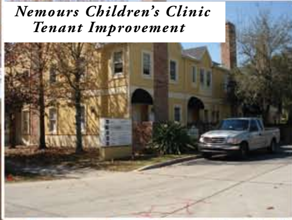
Nemours Children's Clinic Tenant Improvement