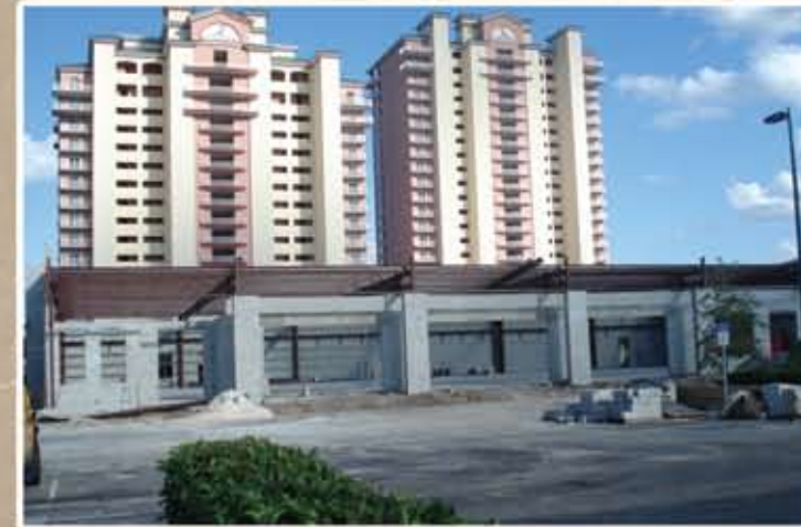
Blue Heron Commercial Center Framing, Drywall & Stucco