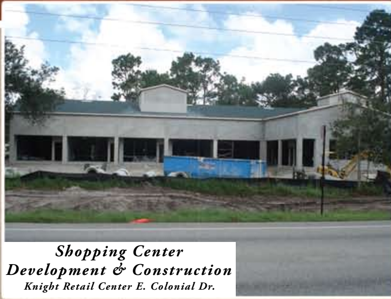
Shopping Center Development & Construction Knights Retail Center E. Colonial Dr.