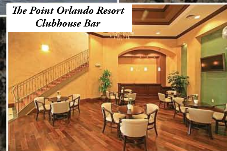
The Point Orlando Resort Clubhouse Bar