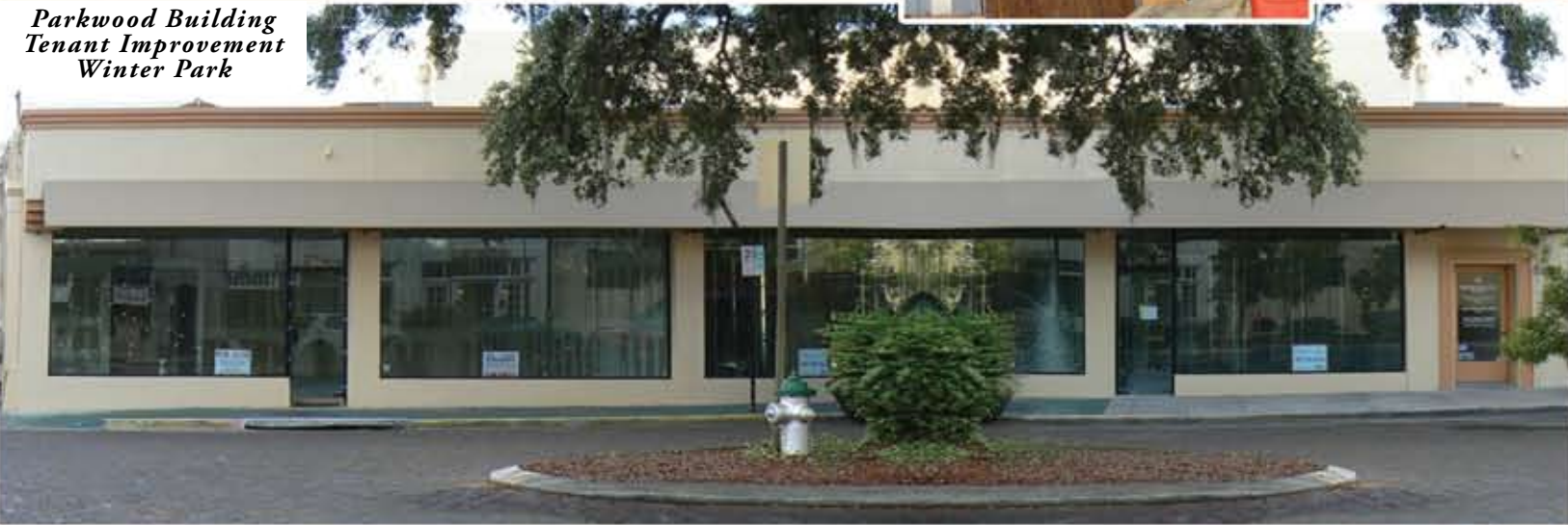
Parkwood Building Tenant Improvement Winter Park

WE INVITE YOU TO PARTICIPATE IN THE DESIGN AND PLANNING OF YOUR NEW PROJECT BY INTRODUCING YOUR OWN CUSTOM IDEAS, OR SELECTING FROM OUR EXTENSIVE HOME - PLAN LIBRARY. WE WILL MAKE CERTAIN TO LISTEN TO YOU AND INCORPORATE ANY LUXURY FEATURES AND AMENITIES YOU SELECT, SUCH AS: UNIQUE WINDOW AND DOOR DESIGNS, BEAUTIFUL AND DURABLE ROOFING, CUSTOM CABINETS AND FLOORING, MODERN APPLIANCES, BATH DÉCOR AND HARDWARE, AS WELL AS FINISHING PAINTS, TRIMS AND MOLDINGS INTO EVERYTHING WE CREATE.