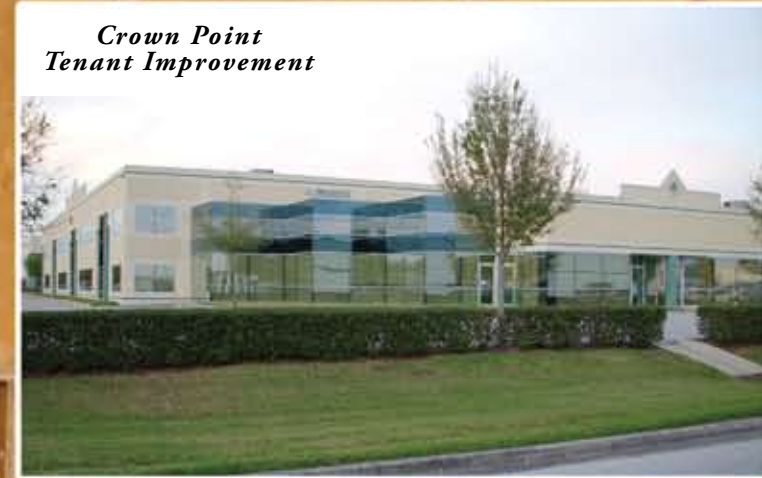
Crown Point Tenant Improvement