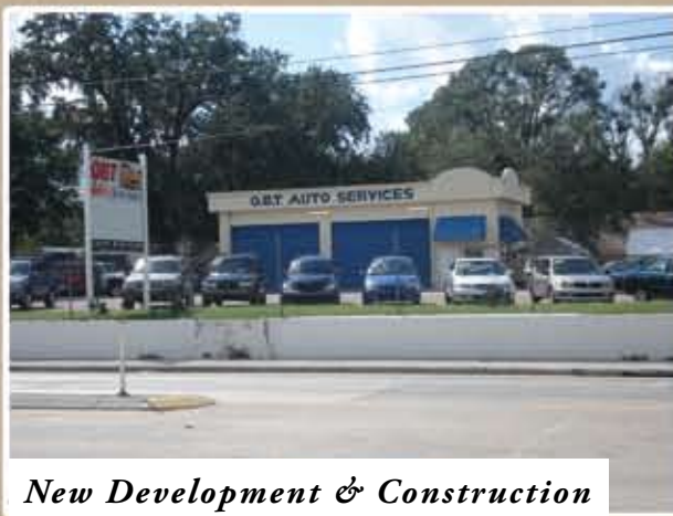
New Development & Construction