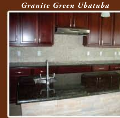
Granite Green Ubatuba