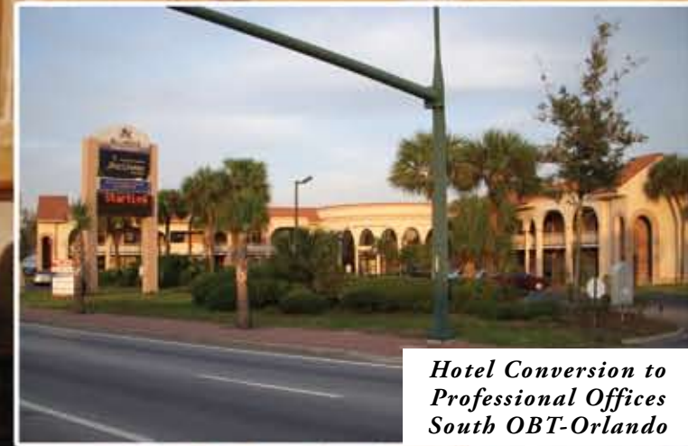
Hotel Conversion to Professional Offices South OBT-Orlando