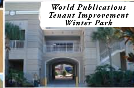
World Publications Tenant Improvement Winter Park