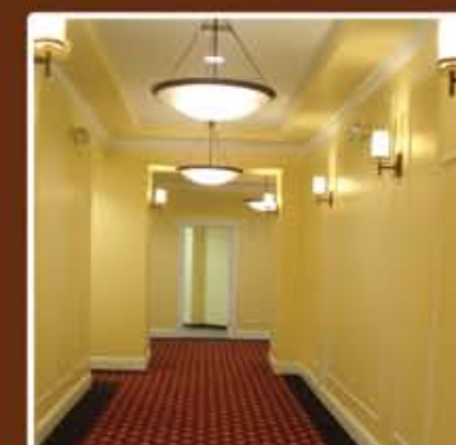
The Point Orlando Resort Conference Room