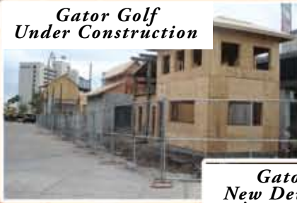
Gator Golf Under Construction