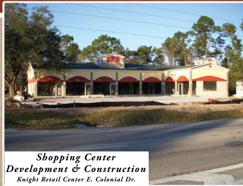
Shopping Center Development & Construction Knights Retail Center E. Colonial Dr.