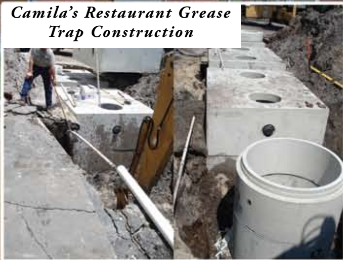
Camila's Restaurant Grease Trap Construction