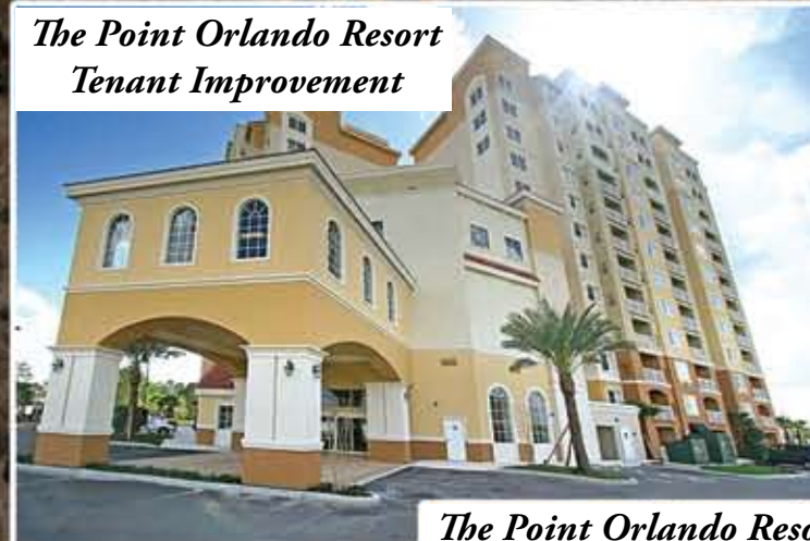
The Point Orlando Resort Tenant Improvement