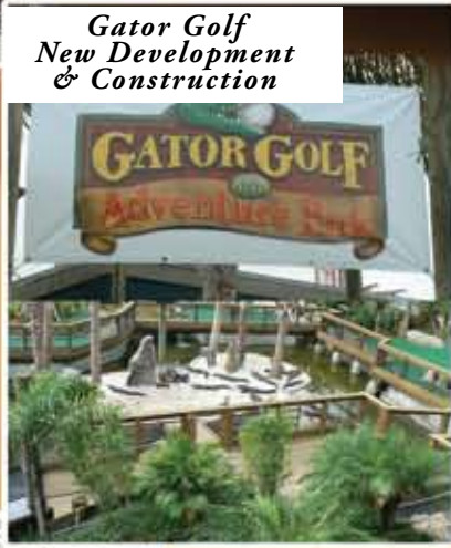
Gator Golf New Development & Construction